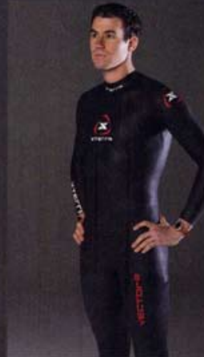
XTERRA WETSUITS VECTOR PRO X2